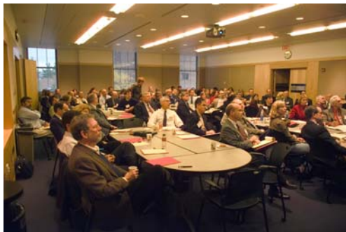
More than 100 participants from Cornell and the community attended the 2005 Economic Development Summit at Cornell

The purpose of the Summit was to explore the university's economic development mission